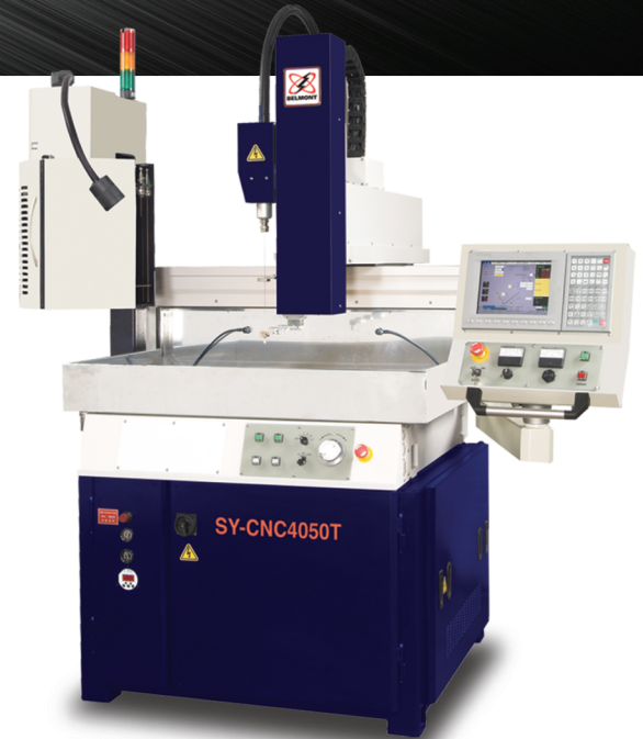
Model Shown: SY-4050T with Automatic Electrode Changer Option

Increases the maximum average current which will reduce the cycle time when using larger diameter electrodes